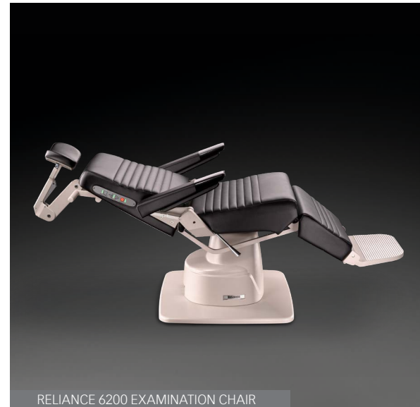
RELIANCE 6200 EXAMINATION CHAIR

Horizontal and vertical movement tailor the stool to an ergonomic fit. It has five legs (with hooded dual-wheel casters) to distribute weight evenly and ensure stability. The legs are finished in tough, black epoxy enamel.