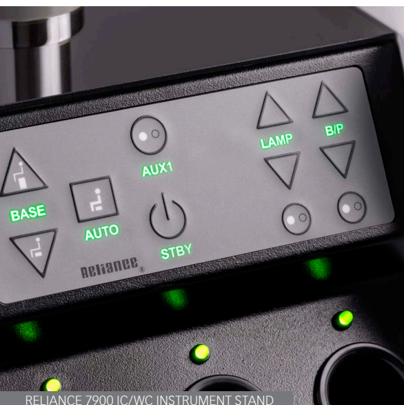
RELIANCE 7900 IC/WC INSTRUMENT STAND

The inclusion of the Swiss-made Haag-Streit AT 870 Goldmann applanation tonometer, the gold standard in tonometry, allows IOP measurements to be taken as part of a routine examination while the patient is sitting at the Reliance SL3 slit lamp.