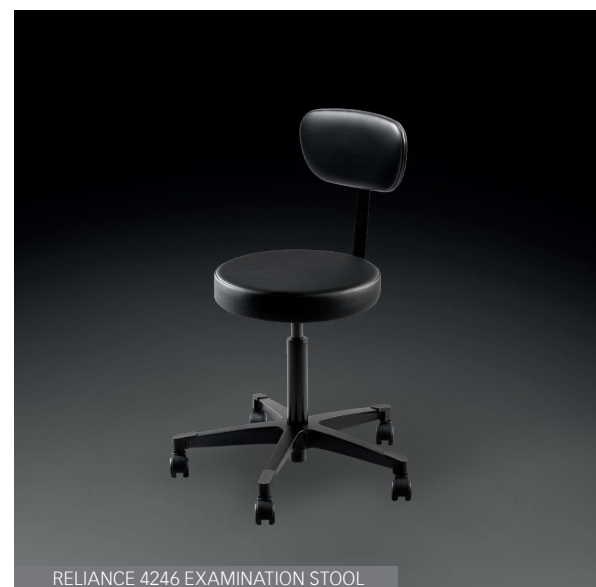
RELIANCE 4246 EXAMINATION STOOL