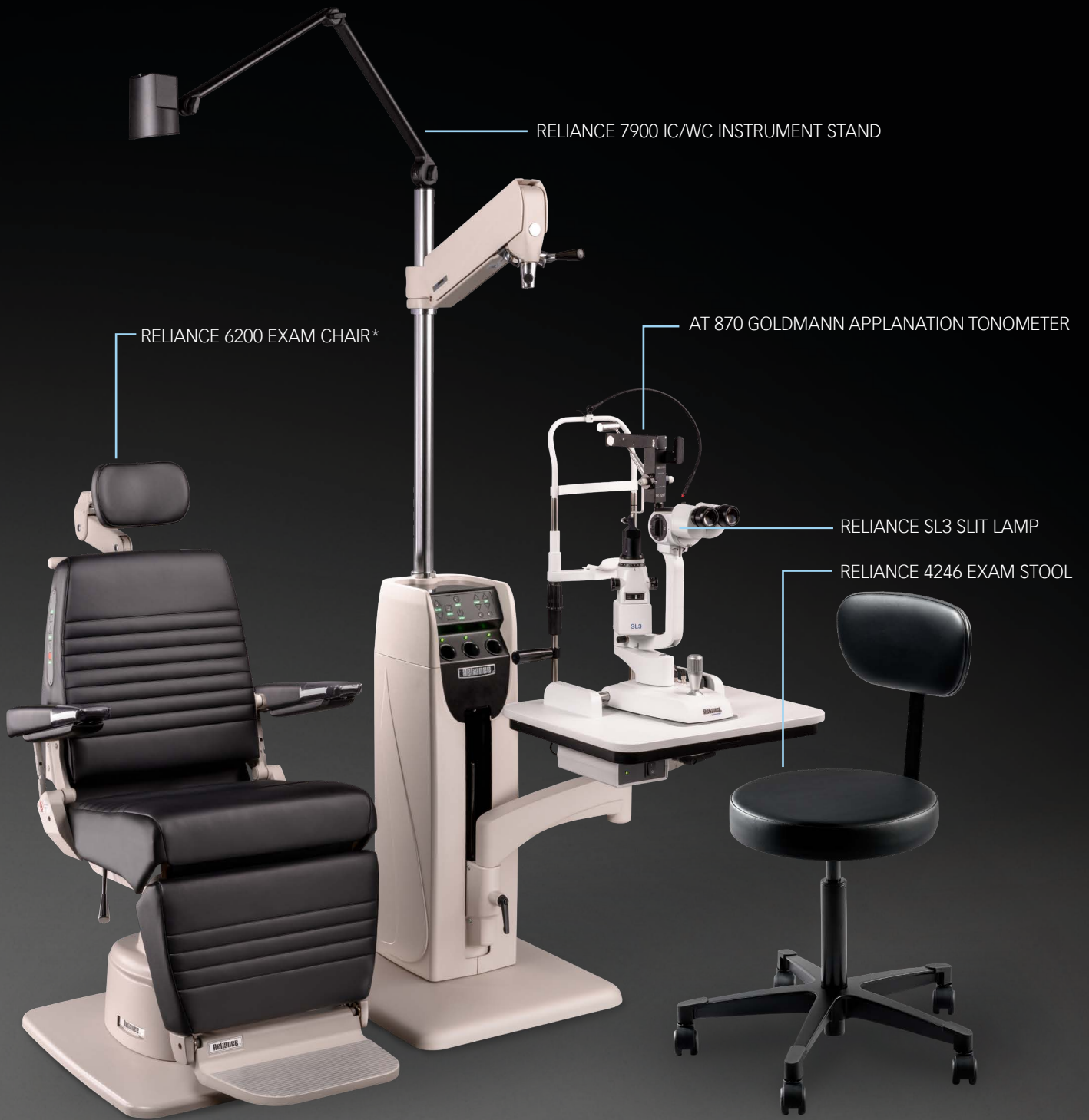
RELIANCE 6200 EXAM CHAIR*