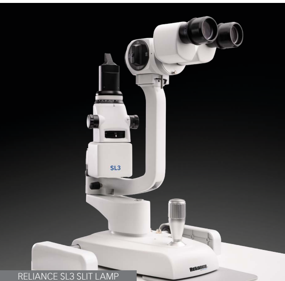
RELIANCE SL3 SLIT LAMP