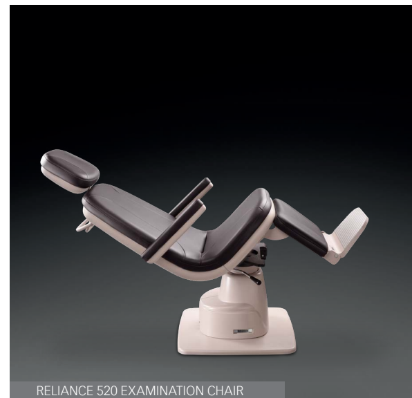
RELIANCE 520 EXAMINATION CHAIR